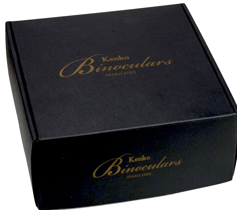
The package design is tentative

Kenko VcSmart comes with the following accessories: